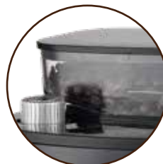
200G BEAN HOPPER